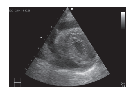
Figure 2. The intracardial defibrillator electrode seen outside the wall of the right ventricle.

ure; heart shadow enlarged, of hypertonic shape.