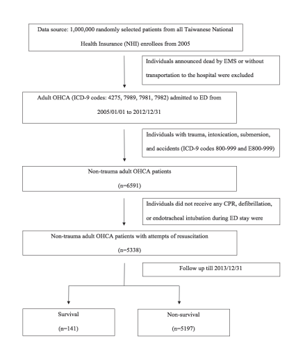
Figure 1. Flow chart of identification of study sample and follow up.

We also considered socio-demographic characteristics (age, sex, level of urbanization, level of hospital, and level of monthly income) in the modeling. Level of hospital is classified as either medical center or non-medical center. (21) Urbanization levels in Taiwan are divided into seven groups according to the Taiwan National Health Research Institute publications. (22) Group 1 is called highly urbanized area, group 2 is moderately urbanized area, group 3 is emerging area, group 4 is gen-