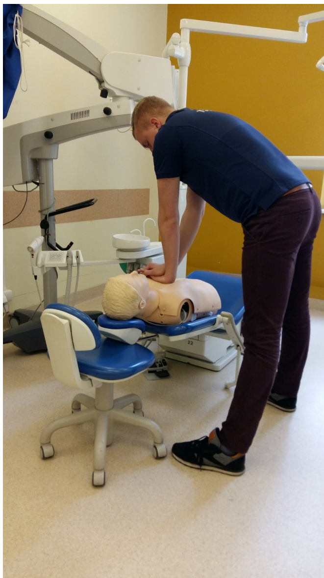
FIGURE 2. The standpoint for experimental test and position of a rescuer.

In the control group, participants performed CC on the floor, whereas the experimental group students performed CC on a dental chair. CC were carried out for 2 minutes without interruptions, and then the groups switched, so that each student could participate in both arms of study, the control and the experimental one. Between each station, students had at least a 10-minute break. The study protocol based on CONSORT 2010 Statement was presented on Fig. 1. The KaVo Primus 1058 S/TM/C/G dental unit (Kaltenbach & Voigt GmbH, Biberach, Germany) was used in the study. The chair was positioned horizontally at the height of 45 cm above the ground. The headrests of the seat were placed as horizontally as possible and were supported by a dental stool for more excellent stability. The unit and stool used in the study as well as position of the rescuer and chair are presented in Fig. 2.