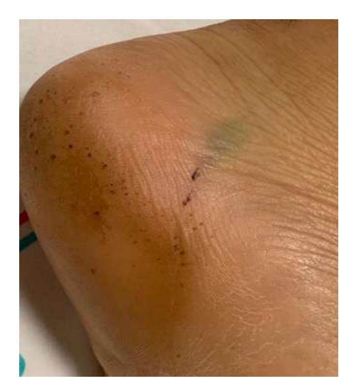
FIGURE 1. A double bite mark with ecchymosis was observed in the upper part of the right heel, which was not initially identified during the first examination.

Magnetic resonance imaging of the brain and spine was performed to exclude central causes and was seen to be normal. On the 16th day of admission, lumbar puncture (LP) and EMG were conducted. The cerebrospinal fluid (CSF) appearance in the LP was clear, with normal pressure. CSF analysis showed albumin-cytological dissociation (no cells were detected, CSF protein was 90 mg/dL, CSF glucose was 88 mg/dL, and simultaneous blood glucose was 145 mg/dL). CSF culture showed no growth. EMG revealed severe motor axonal neuropathy. Considering the quadriplegia, generalised areflexia, albumincytological dissociation in CSF, and electrophysiological studies (EMG) findings, the patient was diagnosed with acute motor axonal neuropathy (AMAN), a variant of GBS. On the 17th day of hospitalization, the first plasmapheresis treatment was completed without any problems. However, vasopres-